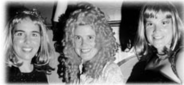
Revelers at last year's Ball