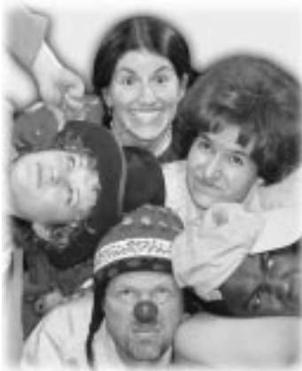
Touchstone Theatre Ensemble's Christmas City Follies comes to Kline Theater on the Gettysburg College campus on Wednesday, December 19 at 7 p.m. for a free performance.

Congratulations to all whose work was chosen, and thanks to all area artists who entered the competition and to our generous sponsors.